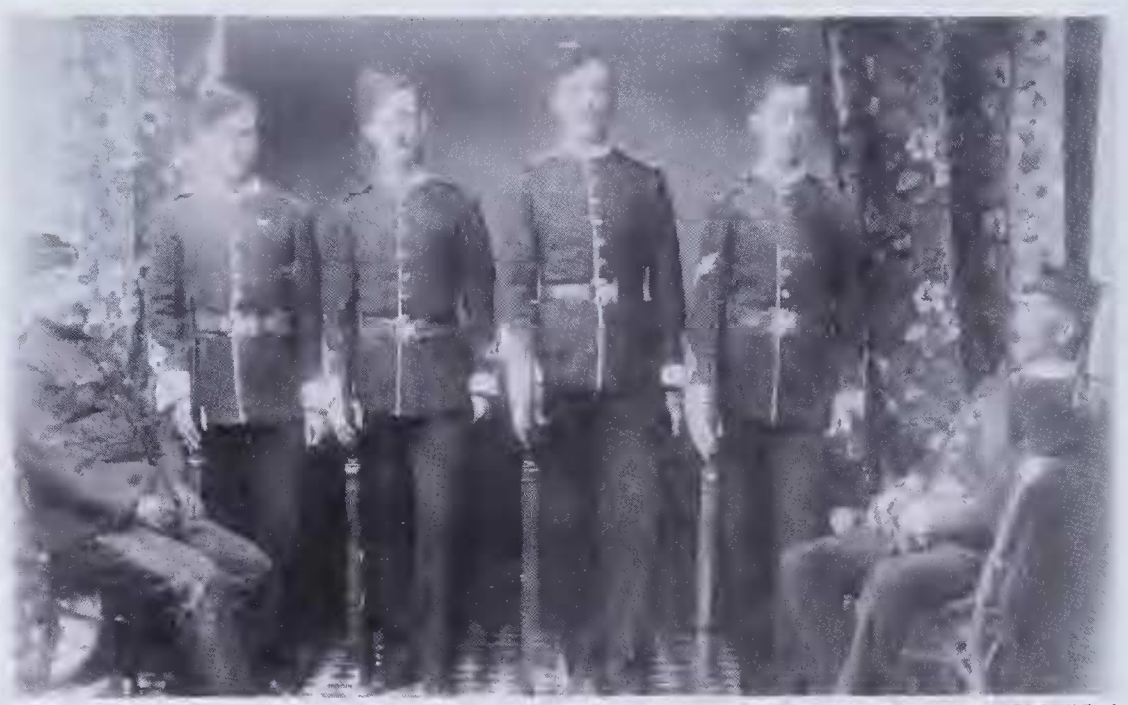
Figure 2 Four members of the Geraldton Rifle Volunteers armed with the Martini-Enfield Rifle Mark I Modified, W.A. Pattern and the Pattern 1888 sword Bayonet.

Western Australian Martini-Enfield rifle